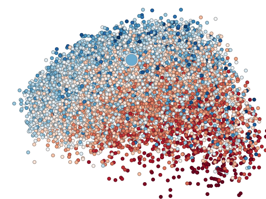
The American Gut Population