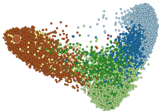
Different Body Sites

AGP Fecal HMP/other Fecal AGP Skin HMP/other Skin AGP Oral HMP/other Oral